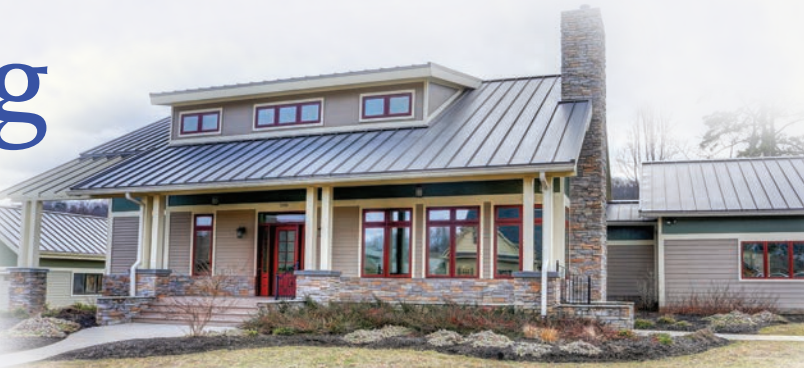
Vacant research house with simulated occupancy leased by ORNL

Through the System/Building Integration Center of Excellence, ORNL provides the means for our industry partners to work out the wrinkles in their new products in low-risk, realistic environments before market introduction. In ORNL's residential and light commercial research buildings, in addition to natural exposure to weather, an average occupant effect on energy use is imposed using process control so