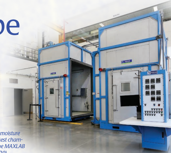
Wall air and moisture penetration test chambers inside the MAXLAB (Building 4020)

To cost-effectively improve the energy efficiency, moisture-durability, and environmental sustainability of building envelopes, the Building Envelope Center of Excellence is exploring new and emerging materials, components, and systems as well as the fundamentals of heat, air, and moisture transfer. The research group is also focused on multifunctional solutions in which the envelope serves as a filter that selectively accepts or rejects solar radiation and outdoor air, depending on the need for heating, cooling, ventilation, and lighting.