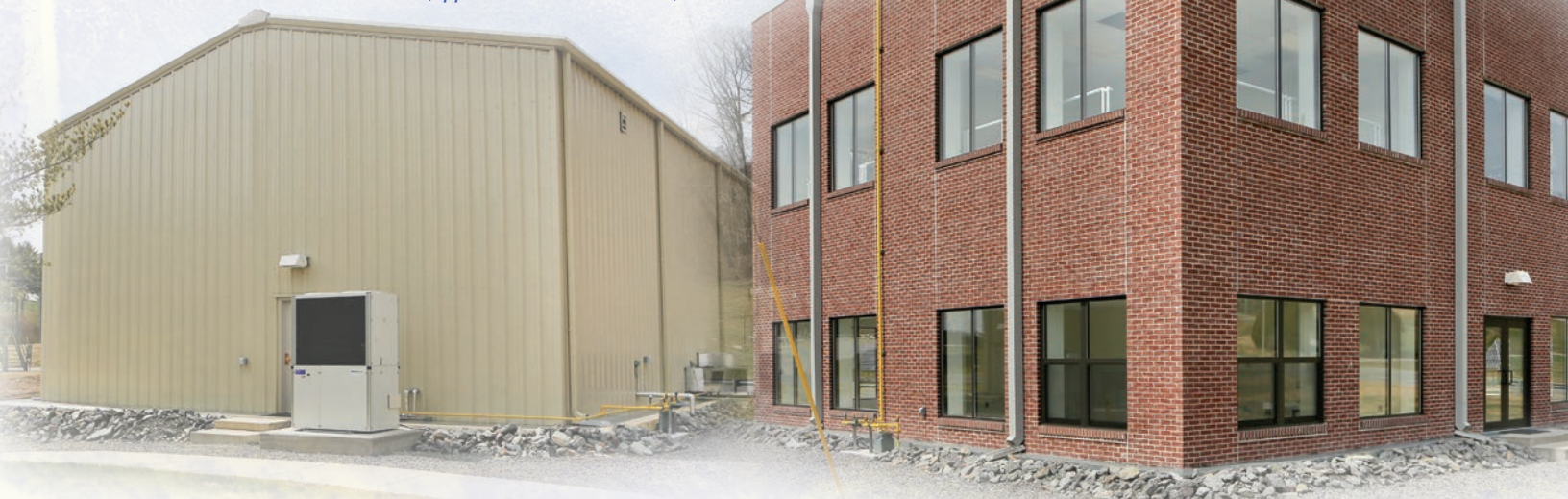
Research buildings on the 1-story and 2-story flexible research platforms (Apparatus 3170A and 3170B)