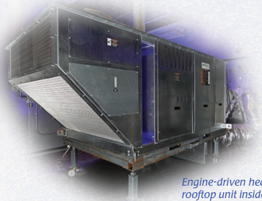
Engine-driven heat pump rooftop unit inside the large “outdoor” environmental chamber (Building 5800, D-103)