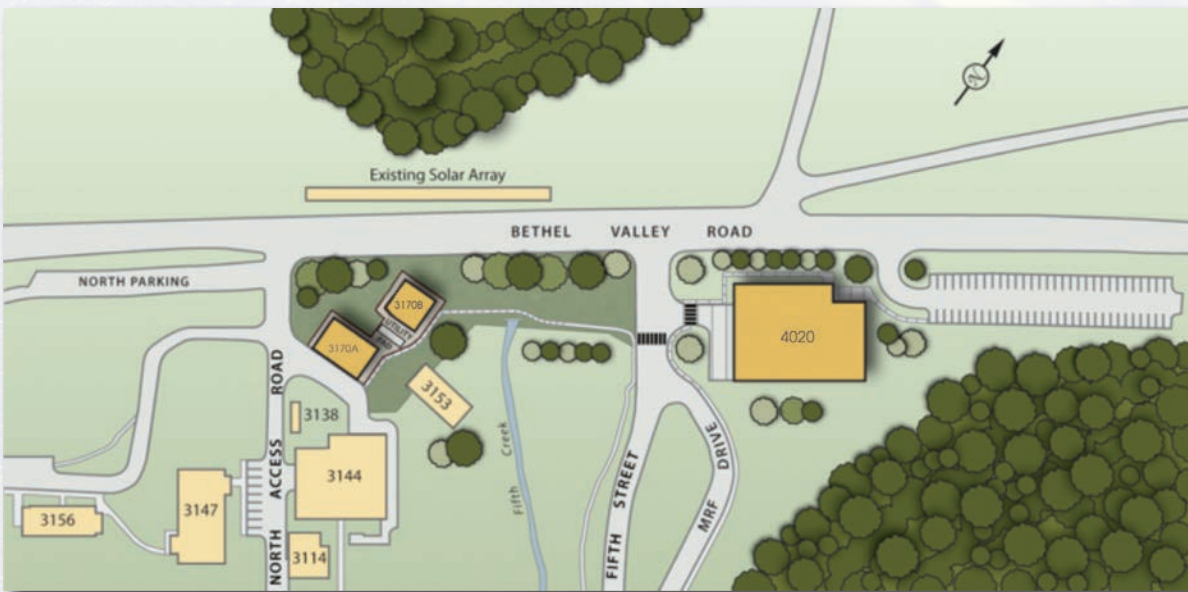
BTRIC offices and experimental facilities are on the ORNL main campus near the intersection of Bethel Valley Road and Fifth Street as highlighted in orange, with the exception of the largest building equipment research laboratory, which is in Building 5800, D-103.