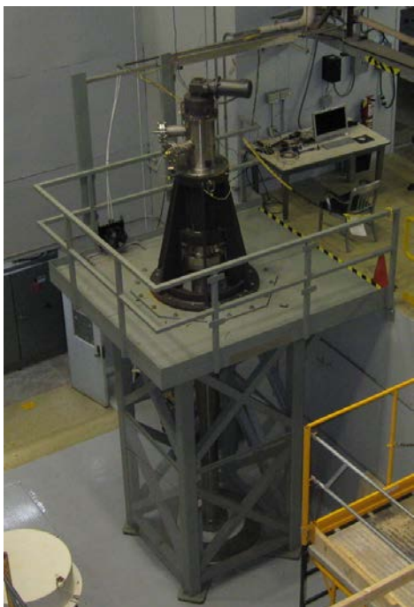
Second Target Station