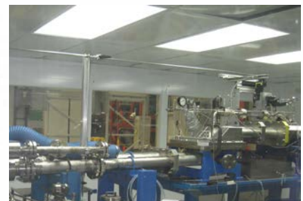
Target Test Facility

Along with Mercury based first target, a second rotating target using tungsten is being proposed. A prototype of the Second Target Station (STS) is located in the pit area of Highbay. Once the design of the STS becomes more mature, discrete testing of components are envisioned in 7603 highbay.