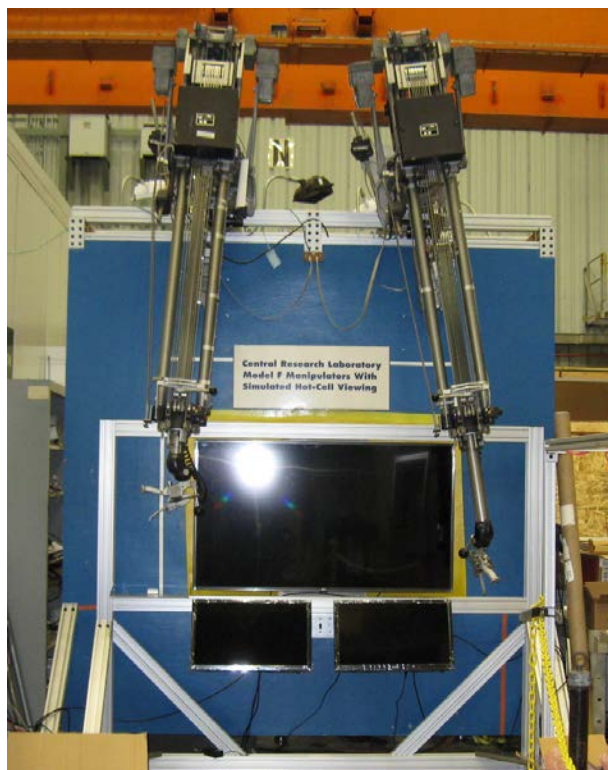
MSM Test Stand

Nuclear Security and Isotope Technology Division conducts testing of Neutron and Gamma detectors to improve the sensitivity of detection. They also test the detectors made by many commercial vendors including international and also certify the sensitivity of detection.