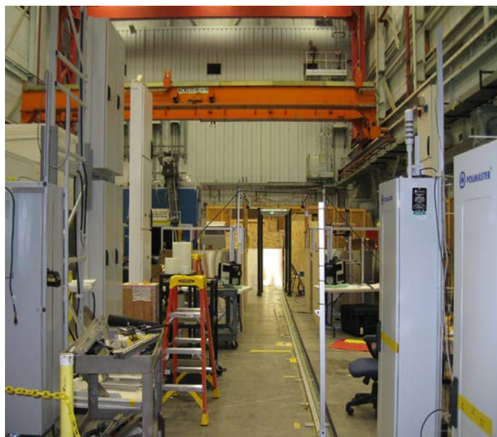
Portal Monitor Testing Facility