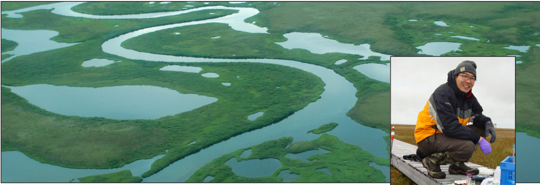
Climate Feedbacks. Landscape topography on Alaska's North Slope determines the distribution of water and vegetation across the Alaskan tundra and thus influences feedbacks to climate. Surface and pore water geochemistry experiments ( inset ), including isotopic analyses, are important indicators for fluxes of CO 2 and CH 4 from degrading permafrost.

Landscape heterogeneity research considers how vegetation, biogeochemistry, and hydrology are influenced by regional landforms such as ridges, valleys, and drainage basins. A key challenge is simplifying the variations in landscape properties and processes for input into models, while still retaining those fine-scale features that have the strongest influence on important ecosystem feedbacks to climate.