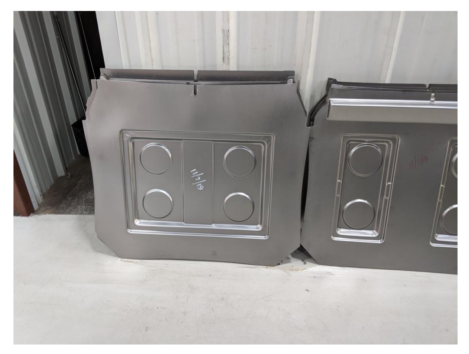
Figure 6. Stamped steel sheet metal components.