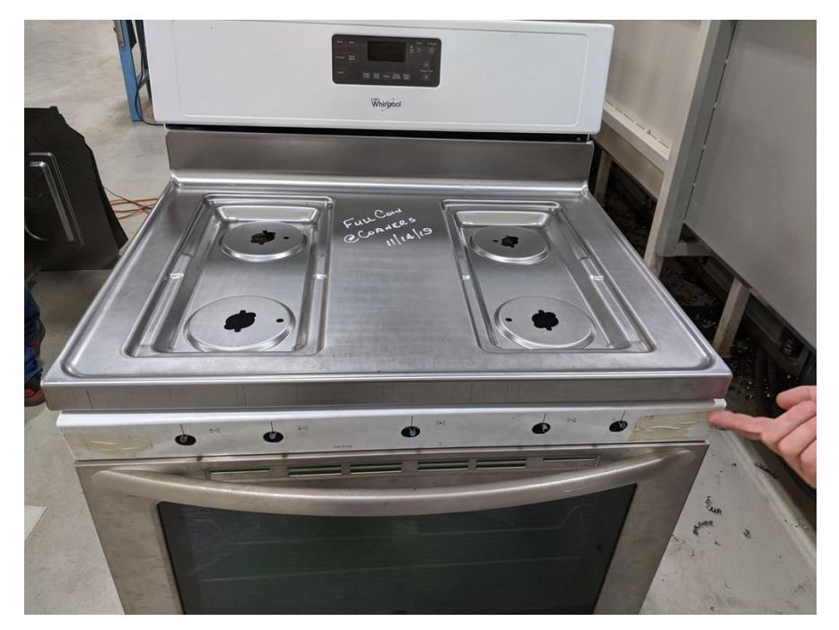
Figure 7. Part application for stove top.

There were substantial lessons learned as a part of this project that will assist further development of the technology. Whirlpool was very specific in the stamping die that they wanted to use for Phase 1. The finished die was less than three inches thick. This did not allow a series of outer beads in one material with an infill in a separate material as had been successfully done many times before. Instead the die was built with the two materials printed side by side—410SS on the side that would be the working surface of the die and mild steel on what would be the back/foundation of the die. This led to greater difficulties in the build and an increased number of defects in the part, though none were sufficient to prevent the stamping die from producing perfectly useable commercial parts. The die was also too thin to use ribbing on the back for lightweighting. The degree of weight savings did not justify the increased print time due to print complexity or the increased post machining time. A larger deeper die will provide more serious justification for AM production.