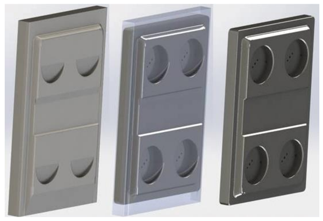
Figure 1. As-printed CAD, as-printed overlaid on as machined CAD, and as-machined part CAD.

operation. Heat treating and/or nitriding would have greatly enhanced die lifetime.