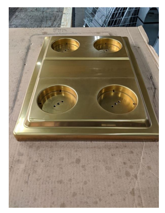
Figure 4. Printed Whirlpool die after machining and nitriding.