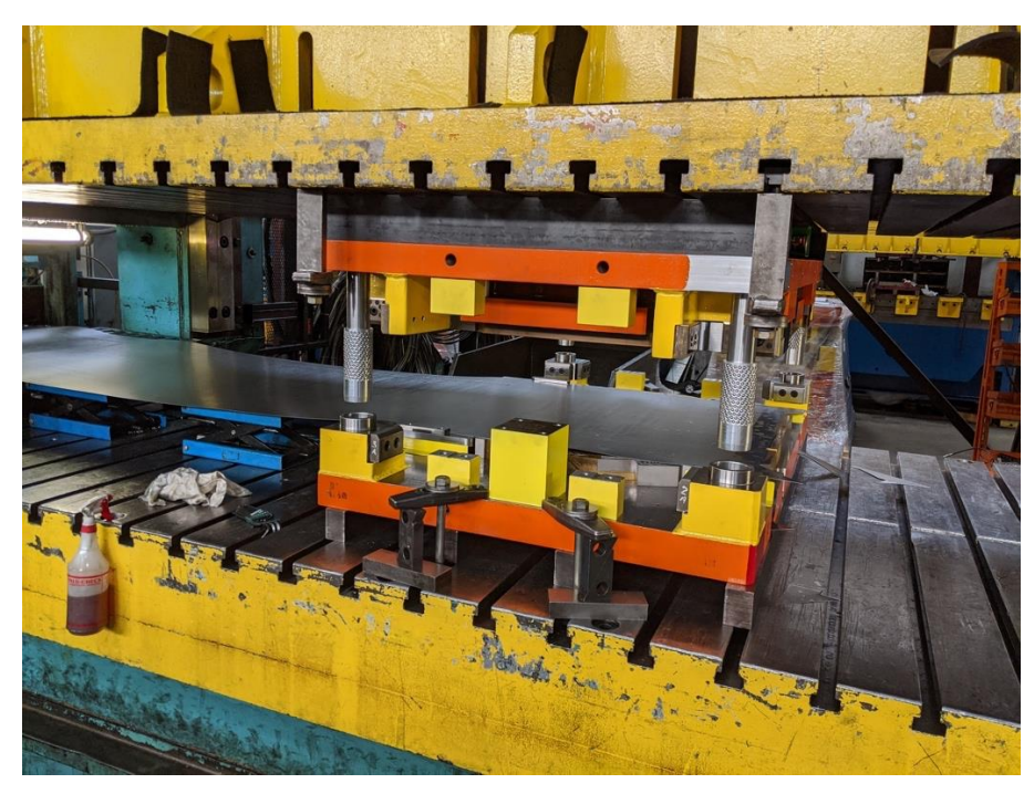
Figure 5. Chelar Industries stamping press used for demonstration.