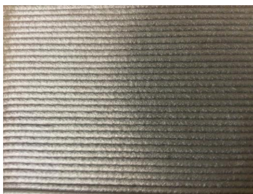
Figure 1. Ridges of a part printed on BAAM.

Elimination of the rough surface of BAAM parts was addressed by examining the durability of surface treatments using epoxy coatings and machining. The success metric of the project was the ability to identify treatments that resulted in an acceptable surface quality of the tool, and to then demonstration of an acceptable lifespan for the treatment.