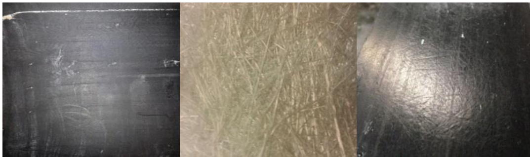
Figure 3. Machined surface of ABS-carbon fiber mold (left), pattern of fiberglass (middle), and imprint of pattern onto machined surface (right).

Fiberglass reinforced composite materials were then hand-laid on the treated mold surfaces. After curing, the composite materials were then pulled off the molds. After the first pull on the machined molds, the pattern of the fiberglass mat was imprinted onto the machined surface (Figure 3). No difference in the surface finish or durability was noticed between the horizontal and vertical builds. The shoe molds each survived a total of five pulls before the surface was deemed too rough for production as determined by visual inspection, indicating that machining yields acceptable durability for one-of-a-kind and some low volume commercial applications.