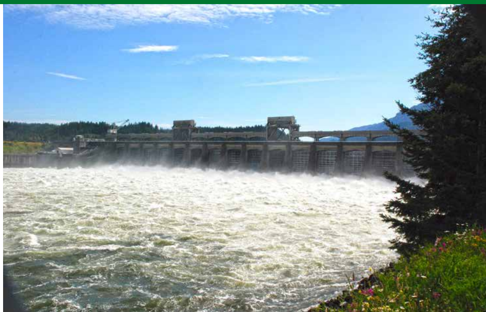
Bonneville Lock and Dam in Multnomah, Oregon.

Aggregated over all PMAs, annual streamflow is projected to increase by 9%, and hydropower generation is projected to increase by about 4%. (However, these projections vary when analyzed by specific PMA region.) Total hydropower generation for all PMAs is projected to be about 120 terawatt-hours/year in both near-term (2020–2039) and mid-term (2040–2059) periods, slightly higher than the baseline (1980–2019) level but with higher variability as the result of more frequent extreme events.