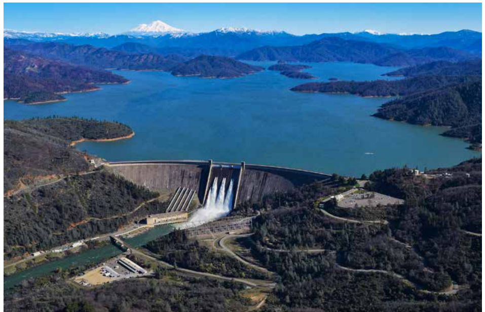
Shasta Dam and Lake in Shasta, California.

Directed by the SECURE Water Act (SWA) of 2009, researchers conducted a series of assessments to evaluate the effects of climate change at 132 federal hydropower plants marketed by the four federal Power Marketing Administrations (PMAs): Bonneville Power Administration, Western Area Power Administration, Southwestern Power Administration, and Southeastern Power Administration.