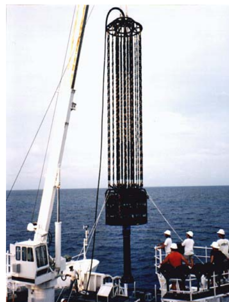
The group developed a frequency-domain beam former to process the data from this large volumetric sonar array.

would not otherwise be possible in applications such as sonar measurements and radar simulation.