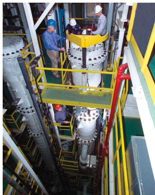
Fig. 3. Centrifuge test stand at the USEC R&D Center in Oak Ridge, Tennessee.

Partnering with MSSE provides collaborative opportunities to pursue programs and projects of various scales that address some of the most challenging science and engineering problems facing the nation today in energy, security, defense, and biomedicine. Through strategic partnerships on a wide range of S&T efforts, MSSE has developed significant experience and abilities that it brings to new partnerships and customers to make the nation and the world energy efficient, safe, and healthy.