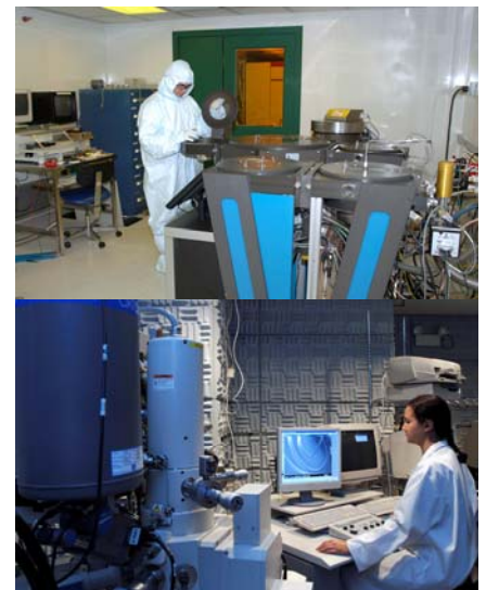
Fig. 1. Nanoscience, Engineering, and Technology Laboratory and associated SEM facility.

MSSE maintains more than 45,000 ft 2 of research laboratories, including 5,658 ft 2 of clean room facilities (e.g., Fig. 1). These laboratories contain semiconductor production systems, measurement and characterization tools, environmental test equipment, robotics systems, and optical and