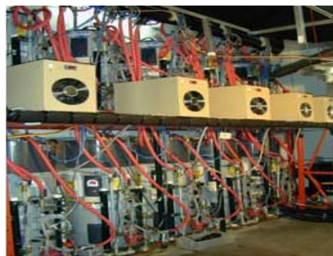
Water Heater Test Facility