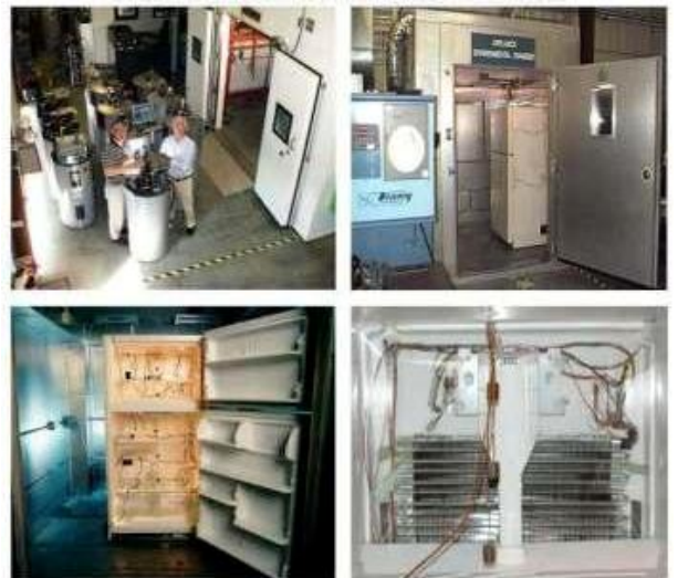
Environmental Chambers at ORNL