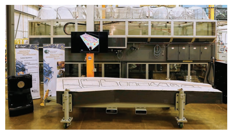
A 3-D-printed trim tool developed by ORNL and Boeing to be used in building Boeing's 777X passenger jet has received the title of largest solid 3D printed item by Guinness World Records.