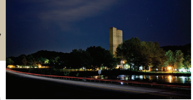
ORNL's Holifield Radioactive Ion Beam Facility.