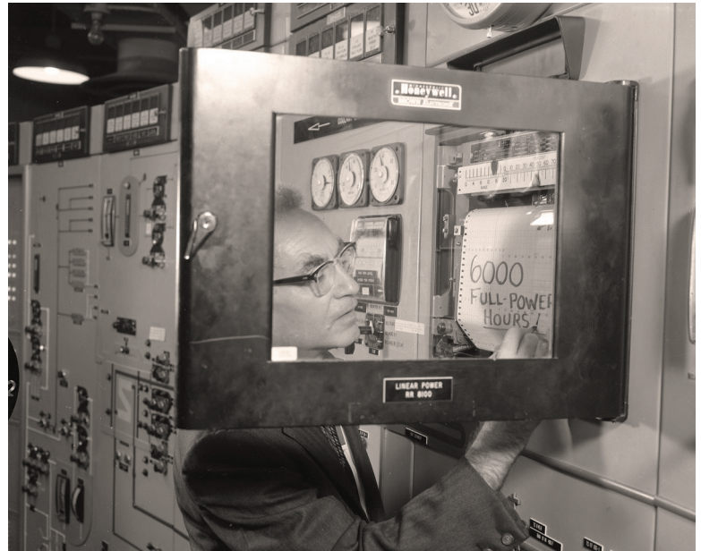
ORNL Director Alvin Weinberg marked 6,000 power hours of performance of his brainchild, the Molten Salt Reactor Experiment, in October 1967.